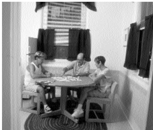
Mental Hospital Seclusion and Restraint Reduction, Commonwealth of Pennsylvania