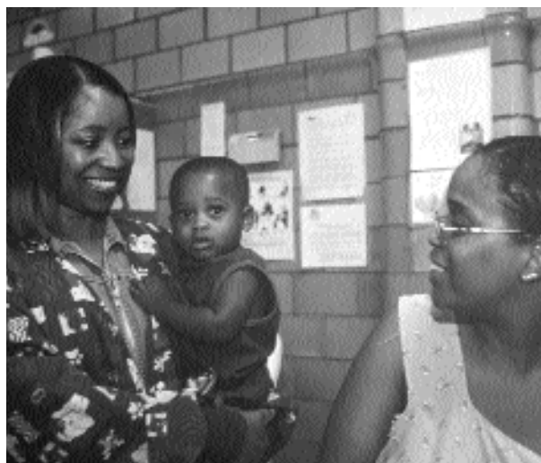
Wisconsin Works, State of Wisconsin

Environmental cleanup is another area that seems to have inspired a host of small “r” results-based Innovations award winners. In 1994 Minnesota