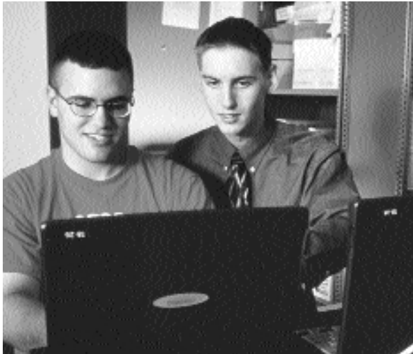
Perritech, Perry Local Schools, Ohio

dozens of other jurisdictions since the program won its Innovations award in 1993. Besides being relatively easy to implement—it was a simple matter of setting up phone mail accounts for clients—it yielded results almost immediately. As reported in Governing's coverage of the program in November 1993, one unemployed power plant worker had six job offers within four days of the program's initiation—job offers that would have never found him absent the voice mail. Within a week the unemployed worker had a job. One month later, fully employed and getting back on his feet financially, he moved into his own apartment. Now that's a fast-acting program—and a great story.