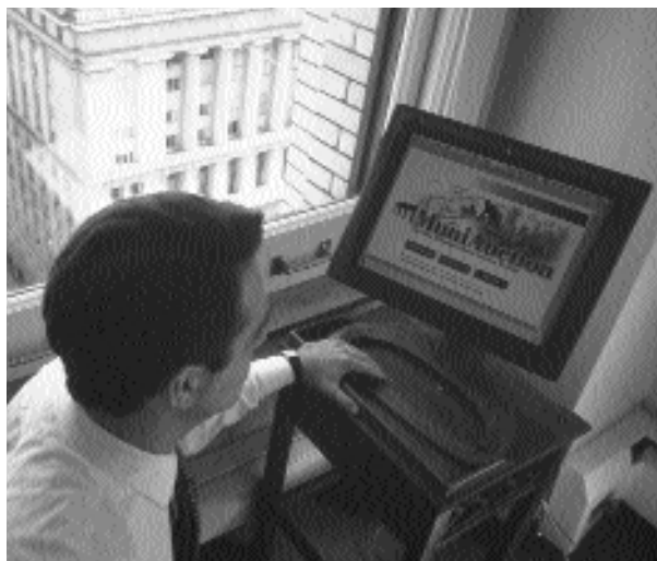
Electronic Bond Bidding Initiative, Pittsburgh, Pennsylvania