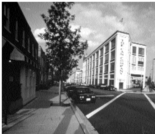
Smart Growth and Neighborhood Conservation, State of Maryland

While Oregon Benchmarks was closely tied to Governor Barbara Roberts, it was, in fact, a legislative initiative, which is one of the main reasons why it manages to stay alive through continuing