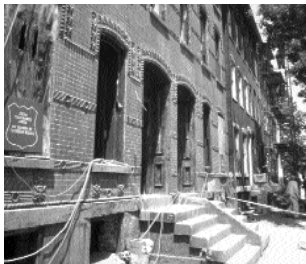
Rehabilitation Subcode, State of New Jersey

Massachusetts, which has had three award-winning environmental programs (in 1991 the state won for the Blackstone Project, in 1999 for its Toxics Use Reduction Program, and its Environmental Results Program was a 2001 finalist), frequently employs