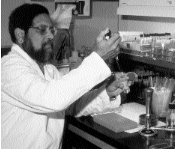
PulseNet, U.S. Department of Health and Human Services

and shut down. The system was developed in response to the cases of widespread food poisoning—however sporadic—that periodically hit various regions of the country. Since its creation, the system has been credited in several instances with keying in on and closing down the source of potentially serious listeria and salmonella poisoning outbreaks before they caused serious harm.