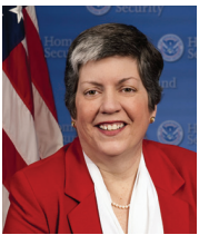
Janet Napolitano, Secretary Department of Homeland Security

“Today’s threat picture features an adversary who evolves and adapts quickly and who is determined to strike us here at home—from the aviation system and the global supply chain to surface transportation systems, critical infrastructure, and cyber networks.”