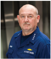
Admiral Thad W. Allen, Coast Guard Commandant (Retired)

“We live in a world of dynamic threats and hazards and must adapt accordingly. We will not change for change’s sake but purposefully, with strategic intent and always focused on our first priority and duty to the nation: mission execution.”